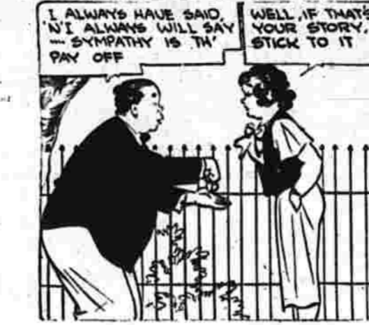
Nothing But The Worst